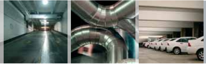
Figure 1 – Typical carbon monoxide monitoring system for a three level parking structure