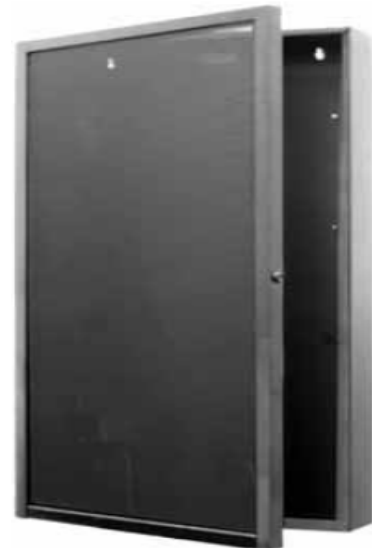
MODEL FCI-D4-D4B door with SBB-D4 backboxMI-6SF