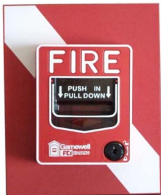
Figure 1 NYC-Plate

The NYC-Plate provides the backplate for the manual pull station. (See Figure 1).