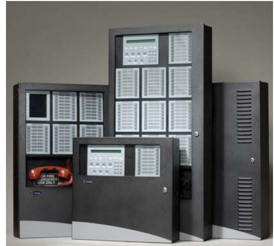
E3 Series ® Cabinets