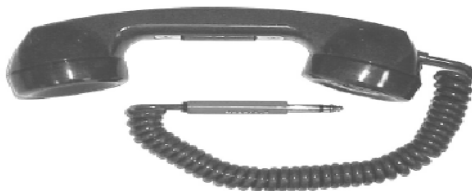
Figure 1 Firefighter's Handset

This handset comes with a coiled cord. The attached plug fits Firefighter's Phone Jack, Model FPJ, allowing firefighters to make direct communications with a central control area.