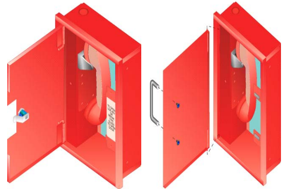
ETC with Key Lock Latch ETC with Pull Handle Magnetic Latch