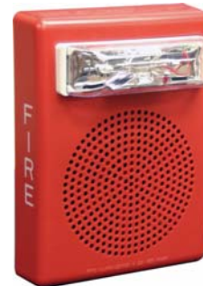
E50 Speaker Strobe