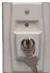
Figure 6 RTS151KEY UL S2522