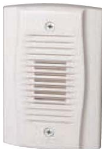
Figure 10 MHW UL S4011