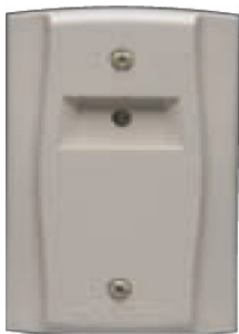
Figure 5 RA100Z UL S2522