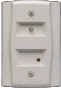
Figure 1 RTS151 UL S2522

Gamewell-FCI provides system flexibility with a variety of accessories, including two remote test stations and several different means of visible and audible system annunciation. As with our duct smoke detectors, all duct smoke detector accessories are UL Listed.