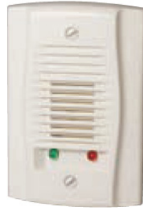
Figure 3 APA151 UL S4011