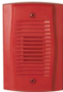
Figure 7 MHR UL S4011