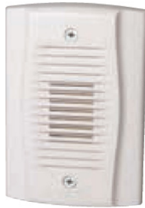
Figure 6 MHW UL S4011