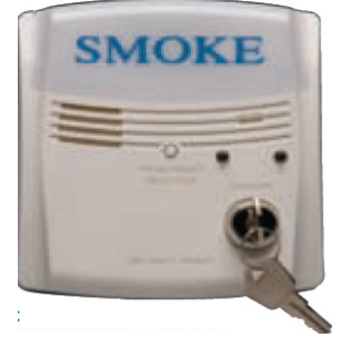
Figure 4 RTS2-AOS UL S2522