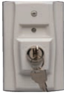
Figure 2 RTS151KEY UL S2522