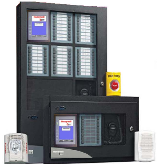
E3 Series Combined Fire and MNS System